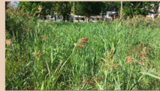
Untreated June 2018