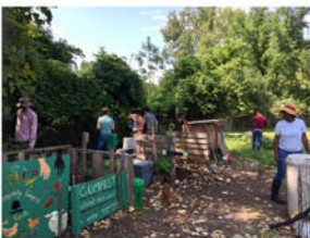
Garden Work Day