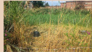
Late June 2018